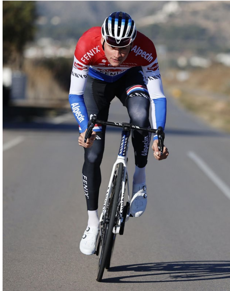
LONG SLEEVE JERSEYS

From our Pro and Elite collections, these close-fitting jerseys are made from insulated and elastic fabrics with brushed fibres on the inside for extra warmth and comfort.