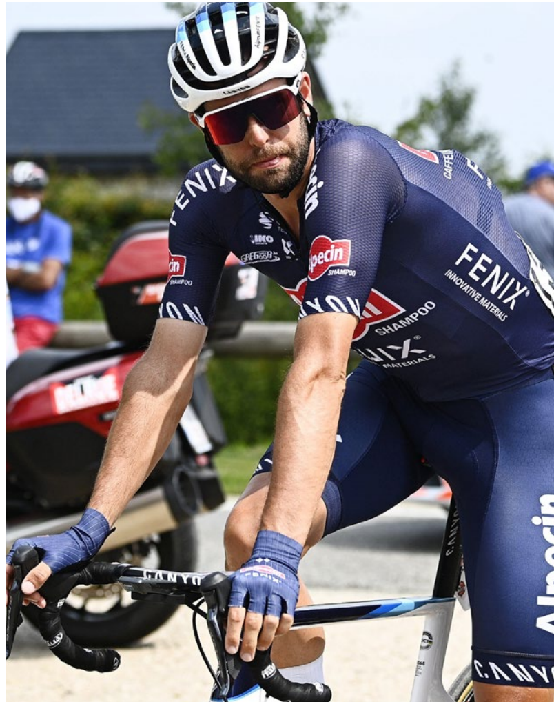
SHORT SLEEVE JERSEYS

Our most selling item is the short sleeve jersey. Choose from several alternatives in each of our collections with many options for different patterns and fabrics. With these different jerseys you are sure to find the perfect solution for your needs.