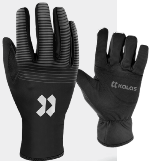
UNI n70577-UP16 (RainMem)